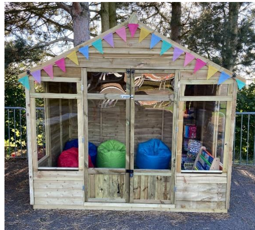
The reading shed