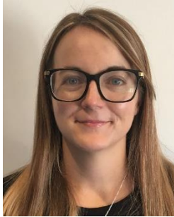
Firecrests